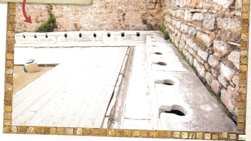
Roman public toilets

Fuller slaves helped to clean Roman clothes, a bit like modern dry cleaners. That doesn't sound too bad, does it? To do the cleaning they had to collect pots full of wee from street corners and public toilets. Then they trod on the clothes in a mixture of wee and water to clean them!